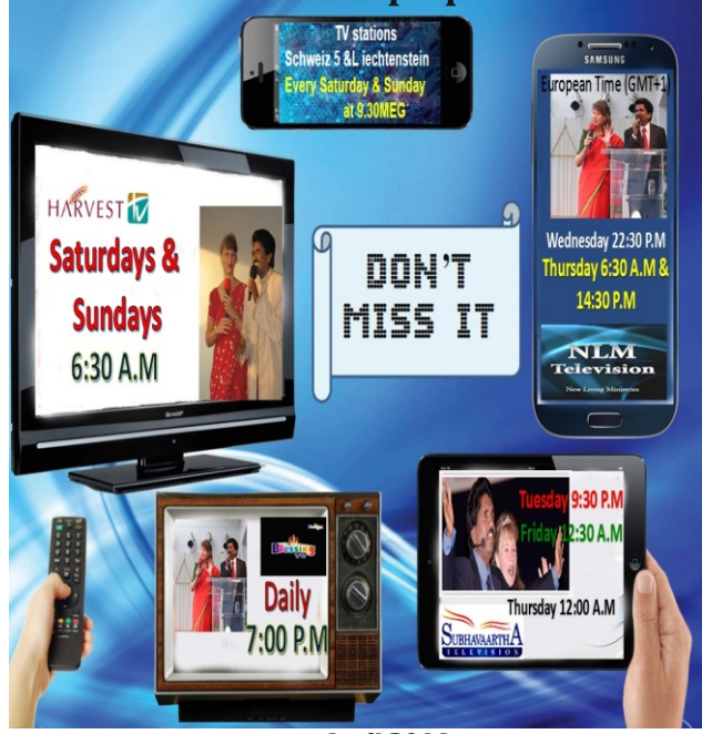
6 Berachah Prophetic Voice - April 2014 www.ezekiahfrancis.org

My name, and a grain offering that is pure; for My name will be great among the nations, says the Lord of Hosts" (Mal.1:11).